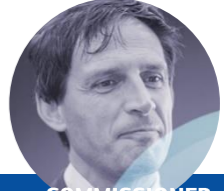
COMMISSIONER : WOPKE HOEKSTRA