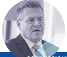
COMMISSIONER : MAROŠ ŠEFČOVIČ